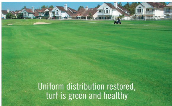
Uniform distribution restored, turf is green and healthy