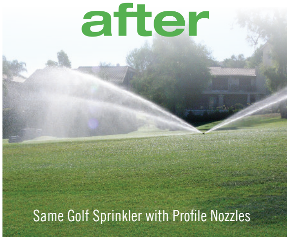
Same Golf Sprinkler with Profile Nozzles