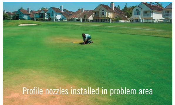
Profile nozzles installed in problem area

Use less water, less energy and less manpower and get better course playability